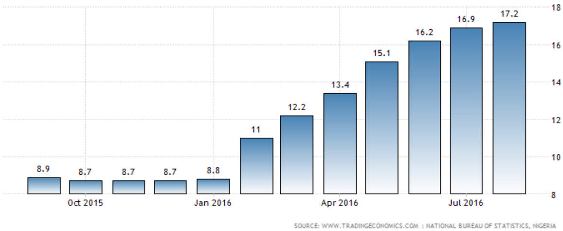
Figure 2. Nigeria's Inflation Rate

Figure 2 indicates the inflation rate in Nigeria. Notice that inflation is spiralling upwards. From an average inflationary rate of 8.7% in 2015, it moved to 13.4% in April 2016. It further soared to 17.2% in July 2016, defying theoretical predictions of depressed aggregate demand that would have driven prices down in recessions like this.