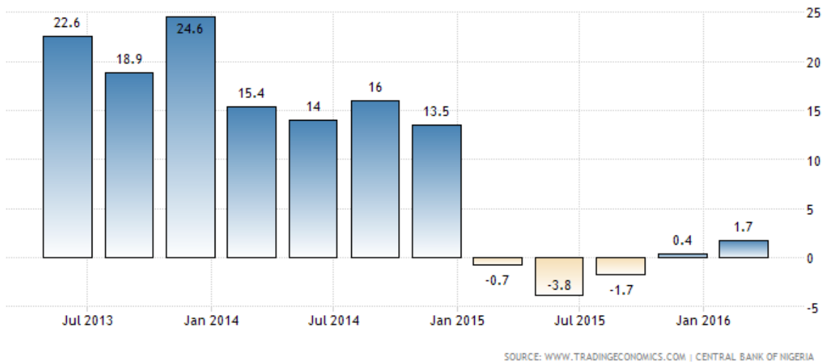
Figure 4. Nigeria's Manufacturing Production

Figure 4 depicts manufacturing production in Nigeria. It interesting to note that manufacturing production in Nigeria fell from 22.6% in July 2013, to 13.5% in Jan 2015. Thereafter manufacturing production became negative at -3.8% in July 2015. It grew to -1.7% in Dec 2015 and it became positive again at 1.7% in February 2016.