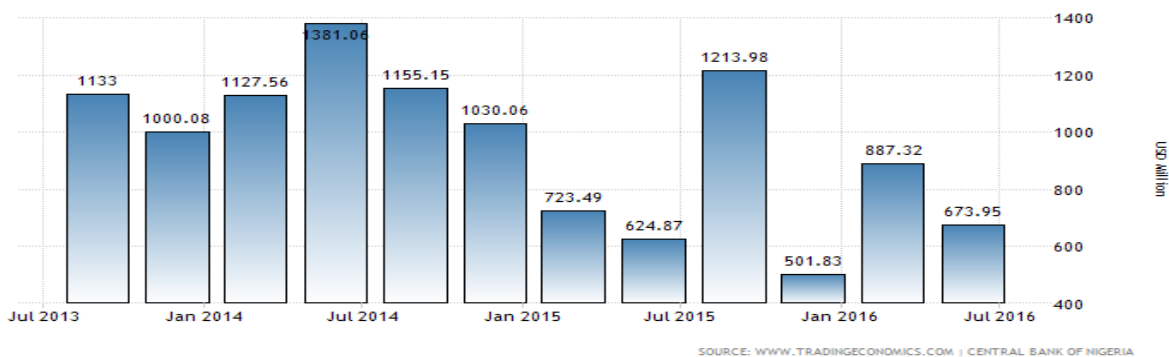
Figure 5. Nigeria Foreign Direct Investment

Figure 5 shows the trend of Foreign Direct Investment into the country. From a peak of $1,381.06m worth of FDI in July 2014, it fell to $624.87m in July 2015. It rose sharply again to $887.32 by end of 2015, but fell sharply to $673.95m in July 2016, indicating serious fluctuating business decision making arising from the nature of the recession and unpredictability of the economy.