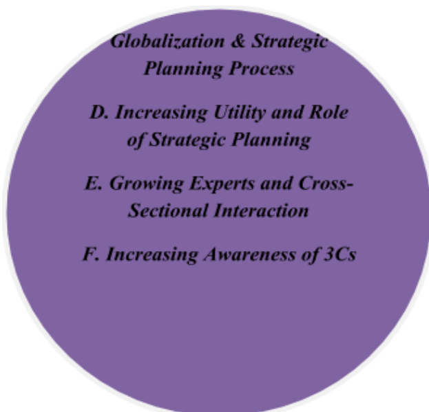
Figure 3. Globalization and strategic planning process, part 2

The role of three Cs in the strategic planning process would be impacted by the globalization. The scale of three Cs, among others, tend to get expansive and came to be internationally required of reshaping a traditional understanding concerning their dynamism and zone of operation (Korukonda, 2006). Now the contemporary organizations, as we see in the case of Coca cola, have to respond to the diversified context of global management. The strategies and tactics may well differ to address a local traits and market demand. The Hong Kong branch of Coca cola would not exactly be same with the US domestic headquarters or market in terms of sales increase strategies. The globalization also contributes to the diversity of workforce. A multiculturalism or support of disabled in the workplace and disadvantaged female cadre in the context of promotion would be a most notable issue that the global enterprises are stumbled with the new concept and requirements (Novitski, 2008). Global organizations engaging in the joint venture agreement are prone to interact with the government of host countries. They are now required to comply with the Code of Conduct enacted by the UN General Assembly. This kind of norms likely operates to shape a proper form of collaboration, cooperation, and coordination. Hence, one impact would be that a multiplicity of norms and authority should be present to interplay with the organizations and affect the traditional pattern of 3 Cs (Owusu-Ansah, 2014).