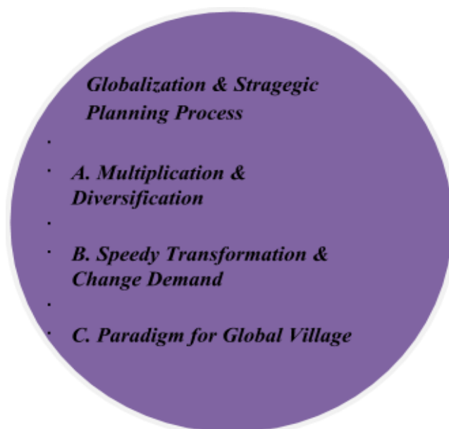
Figure 2. Globalization and strategic planning process, part 1

The globalization and free trade are necessarily associated with the hawk eyes of capitalists that the skills and technology, capitals are fast imported and shared (Glover, 2004). This generally incurs a high speed of societal transformation and the change demand brings a crucial role of strategic process to survive and improve the organizational performance. Even for the consumers like us, this phenomenon is palpable and demanding to change. So suppose how it would be serious and consequential for the organizations let to compete and struggle. This increasing pressure can be viewed to make the strategic mind and practice indispensable and rampant across the individual and organizations (U.S. Small Business Administration, 2013). This point also influences the mode of strategic planning process since the communication and exchange of ideas are facilitated and instant (Glover, 2004). Now a video conference is a normal way to manage the multinational corporations, and valuable information can be transmitted easily and frequently. The time to turn on the strategic change cycle would be shortened, and any more frequent context of top leadership can be practiced. "Planning other than plan" as adverted by Eisenhower would now truly be realizable.