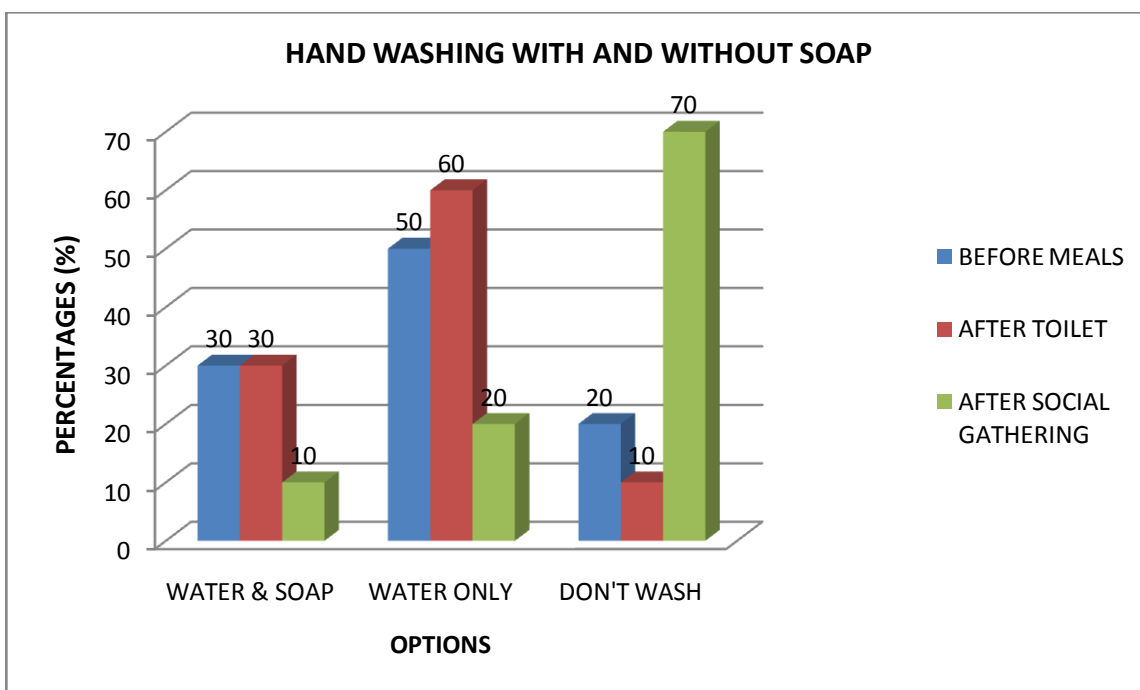
Figure 1. Bar chart representing hand washing activities of respondents after three events