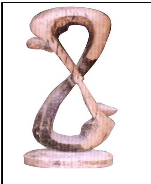
Figure 5. Acrobats, Ebony wood, 105cm, 1994