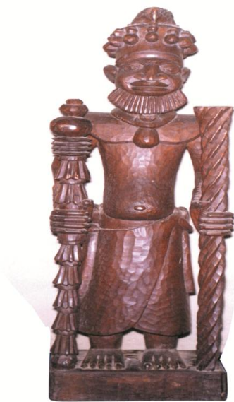
Figure 3. Ifa Priest, Iroko wood, 140cm, 1978