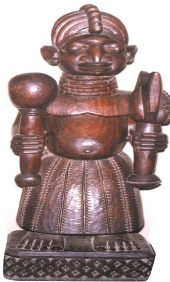
Figure 2. Shango Priest, Iroko Wood, 125cm, 1977