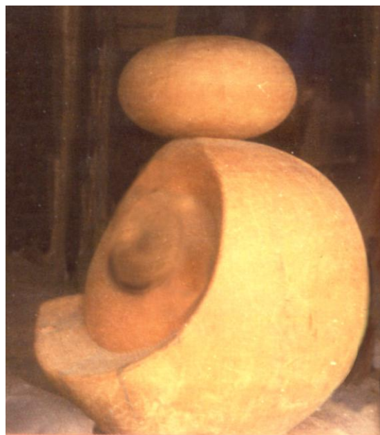
Figure 7. Evolution, Opepe wood, 75cm, 1996