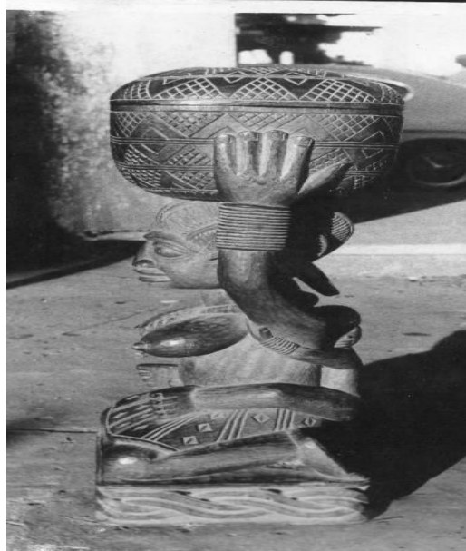
Figure 1. Arugba, Iroko Wood, 90cm, 1976