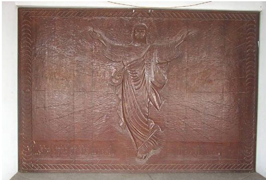
Figure 4. Ascension of Christ, Omo wood, 300 x 330, 1986-87

in 2008, he avowed that his training in western art education broadened his horizon. His Christian theme commission (Figure 4) in the 1980s elucidates the rudiments of life drawing, perspective and composition. Figures 5-7 show other formal experiments within the ambits of realism and abstraction as interpreted within his understanding of western stereotypes.