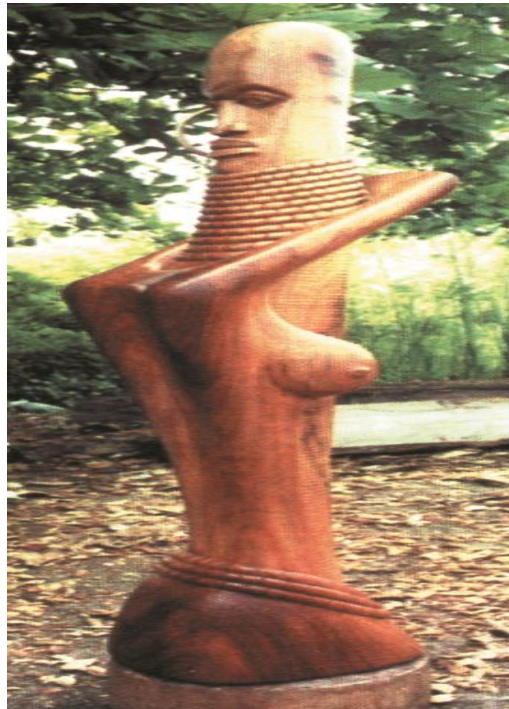
Figure 8. Toko Taya, Cam wood, 180cm, 1998

From this point, a definite style which Edewor, (2009) refers to as modern Yoruba style began to evolve in Bisi's practice. Figures 9 and 10 further espouses the new stylistic trend. The assessment that Bisi diversifies, elongates, stylizes and texturizes his surfaces, weaves within the matrix of intricacies that surrounds the contextual realities discussed above.