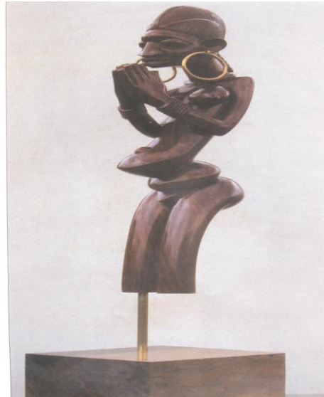
Figure 10. Adura lo n gba, agbara ki gba, Oro wood, 95.5cm, 2003