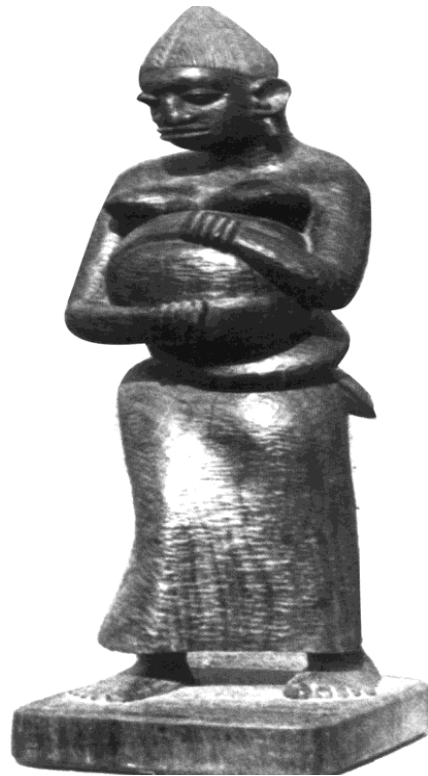
Figure 6. Confidentiality, Cam wood, 90cm, 1994