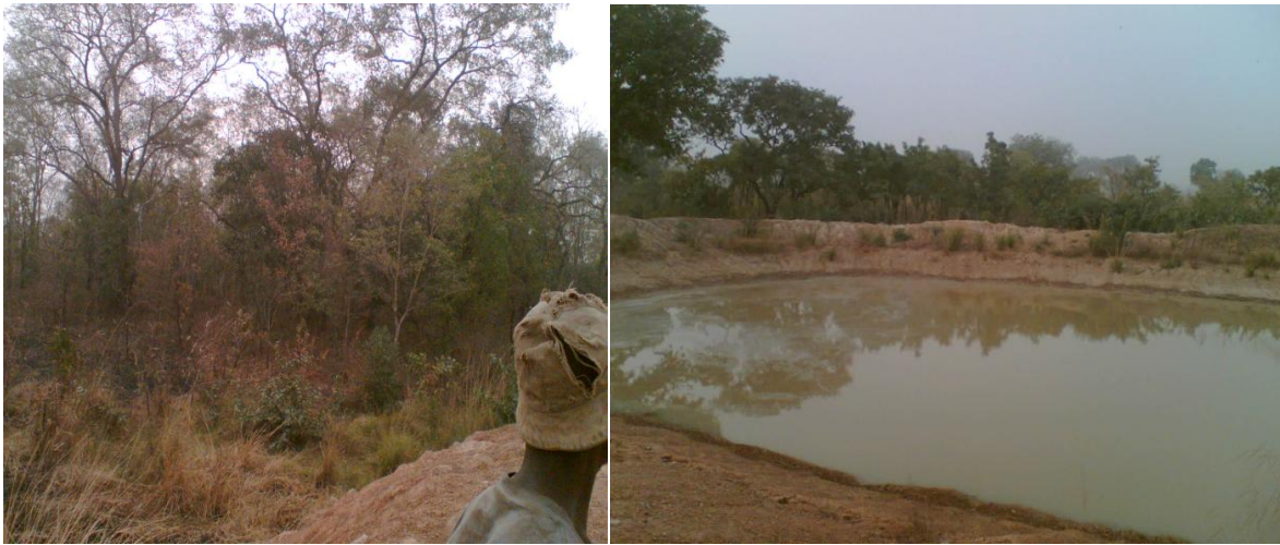
Figure 5. Zorbogu community sacred grove and pond