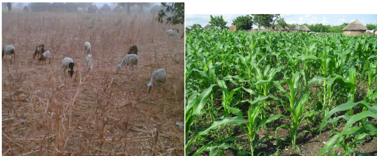
Figure 3. Sheep grazing on the maize stocks during the dry season. Maize during the wet season.