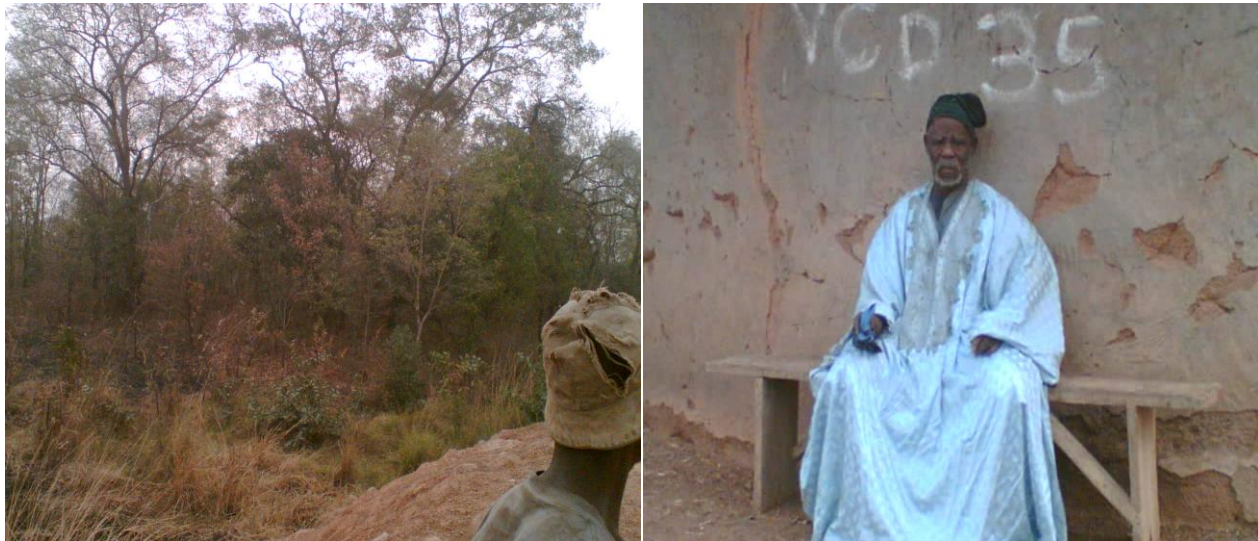
Figure 2. Zorbogu community sacred grove and Chief

SOC levels were highest in the natural forest stand followed by the non-burnt farm and the teak plantation. The burnt farm recorded the least levels of SOC. Non-burning on-farm is a good farming practice that improves SOC and hence soil fertility thereby improving crop yields even on continuously cropped lands.