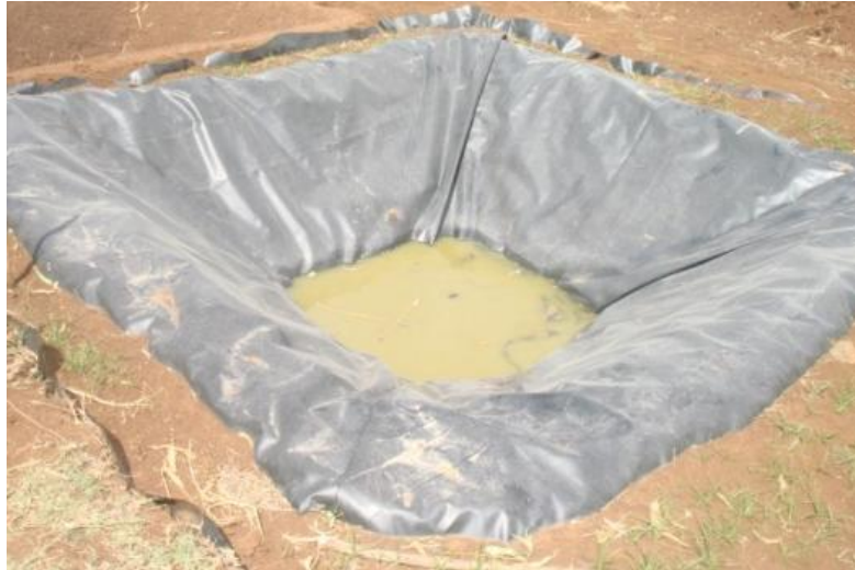
Figure 9. Geo-membrane lined pond