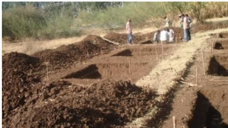
Figure 3. Edge of the pond

From the edge of these squares 0.5m area is marked around each square and leveling work is done only on this part rather than leveling the whole plot area (Figure 2). This area later served as the edge of the pond and as a zero level for the pond (Figure 3). Pond excavation work was then started step by step and layer by layer down to one meter depth. To attain the actual pond side slope of 1:1 (H: V) we followed two types of excavation procedures, refill and cut type (Figure 4).