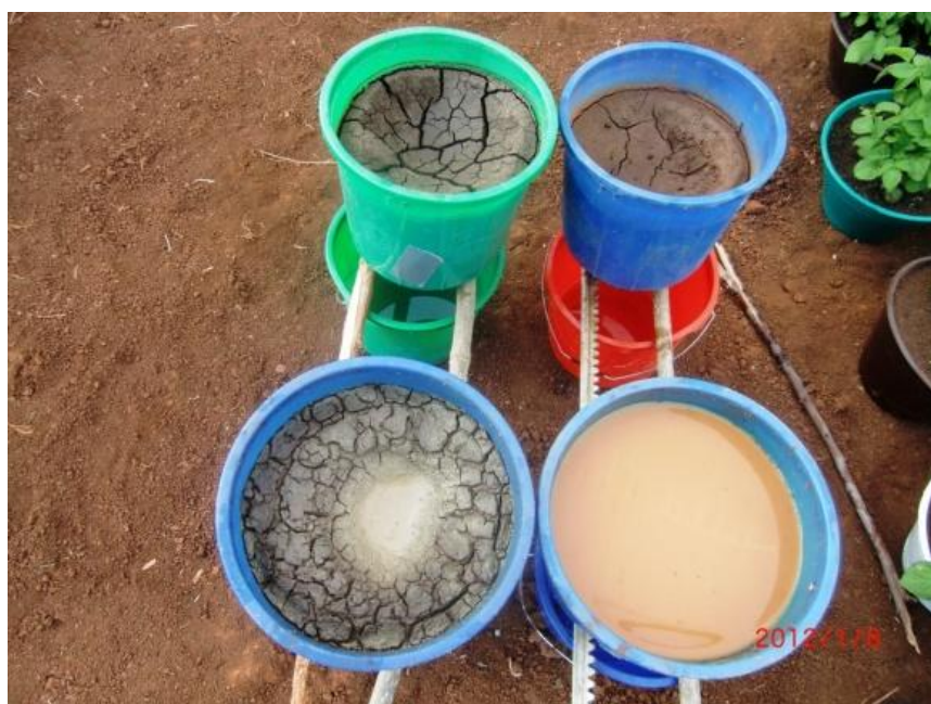
Figure 13. Storage characteristics of table salt treated and un-treated soils compared at Adet during 2009/10 to 2010/11

Electrical conductivity of water sample, Texture, exchangeable sodium, calcium and magnesium of the soil were analyzed for each treatment after fifteen days and the results were summarized in the following table. Sodium adsorption Ratio (SAR) is a widely accepted index for characterizing soil sodicity. When SAR is greater than 13, the soil is called sodic soil. Excess sodium causes poor water movement and poor aeration.