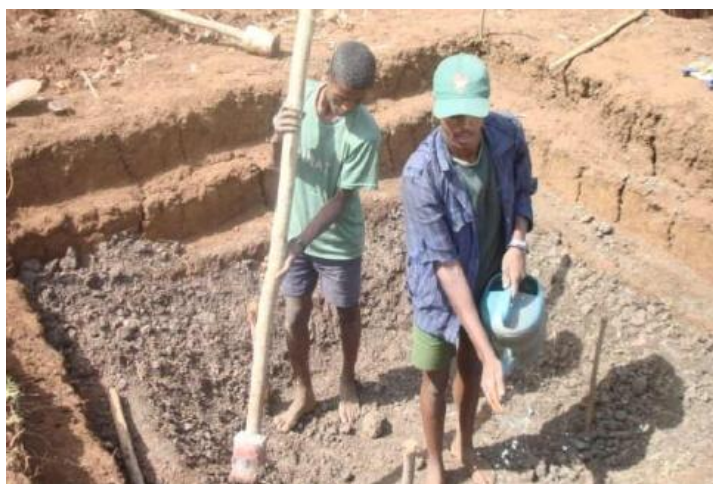
Figure 6. Clay re-filling technique used at Adet

For the fill type ponds also the procedure was the same. The only difference was that at the inception the first square to start working on had a size of 3.5mx3.5m rather than 3mx3m as opposed to the previous condition. In the fill type ponds (i.e. Clay lined pond, Cement+soil filled ponds), the actual side slope 1:1 (H:V) was obtained by systematically filling the aforementioned materials.