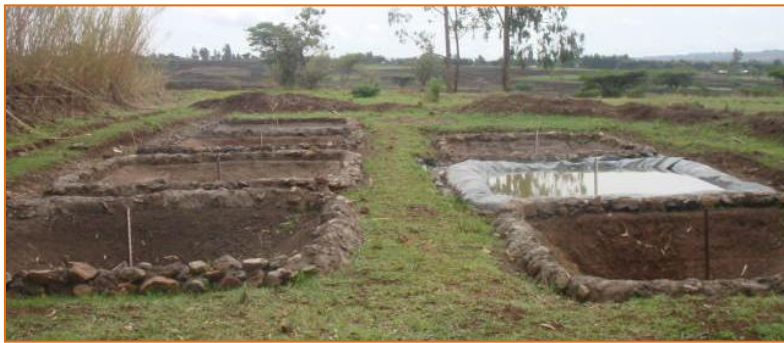
Figure 12. Final Experimental Setup