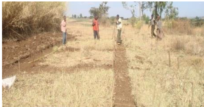
Figure 1. Land lay out work

Before starting the actual excavation work, the lay out work was done first. Square plots of area 3m x 3m were marked on the ground using pegs (Figure 1).