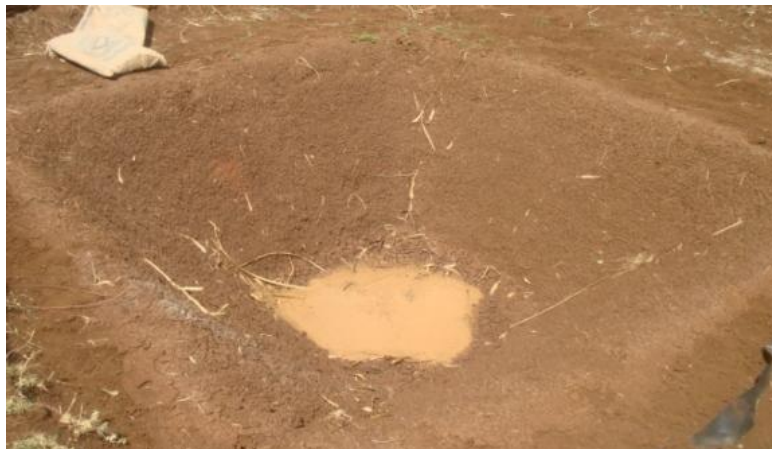
Figure 10. Table salt treated pond

For the table salt treated pond, around 11.5kg of table salt was dissolved in water and applied on the pond surface at a rate of 2kg/m 2 during the first application. Again after a week the remaining 11.5 kg was applied (Figure 10). The control pond is also excavated in the similar fashion by reshaping the subsequent stairs and was left untreated (Figure 11).