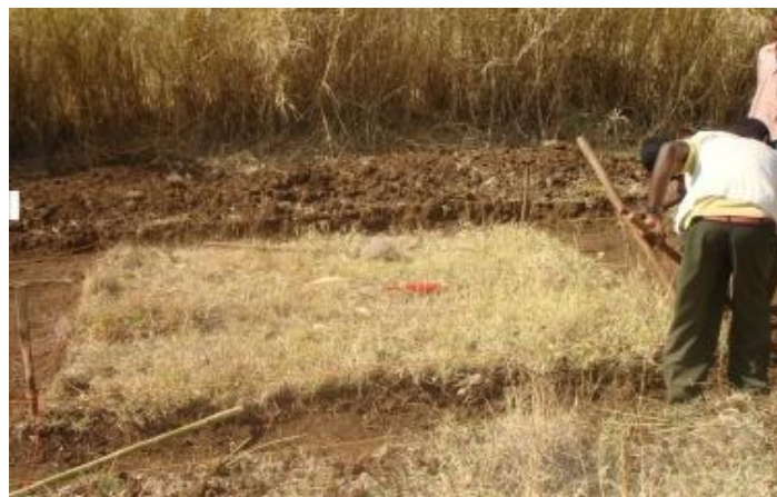
Figure 2. Land leveling work