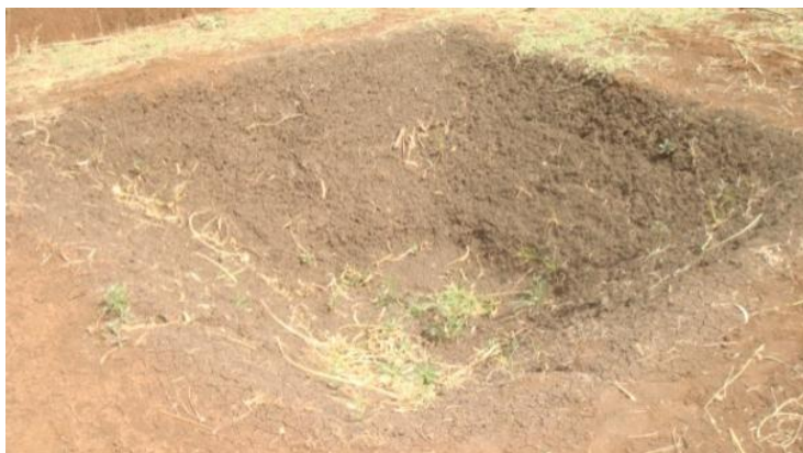
Figure 7. Actual shape of clay lined pond

For the clay fill pond, clay material (Vertisol) was transported to the area and step by step filling was done starting from the base by compaction (Figure 6). Small amount of water was applied during compaction to moisten and facilitate binding of the soil material. Then the set of stairways were re-filled carefully up until the desired side slope (1:1) and smooth surface was finally maintained (Figure 7).