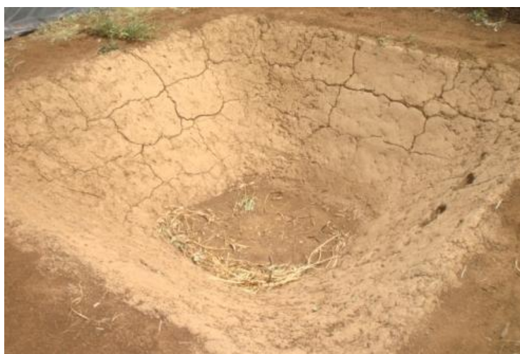
Figure 8. Actual shape of cement + soil lined pond

For cement +soil filled pond, cement and excavated soil material were mixed in 1:5 ratio. The bottom area of the pond excavated to 15cm depth and re-filling of the subsequent stairs started from the base of the pond (Figure 8).