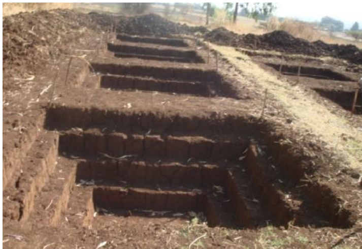
Figure 5. Step by step digging procedure followed during pond construction at Adet

another 25cm is measured inside this square from each edge and 2mx2m square area is delineated. This square plot is again excavated to a depth of 25cm. This procedure is repeated up until a total of 1m depth and 1m X 1m square bottom area is obtained (Figure 5).